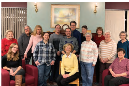
Friends of the Chili Public Library Board

The Chili Public Library is the center of lifelong learning for our community, and a welcoming responsive place people come to for the discovery of new ideas, the joy of reading and the power of information.