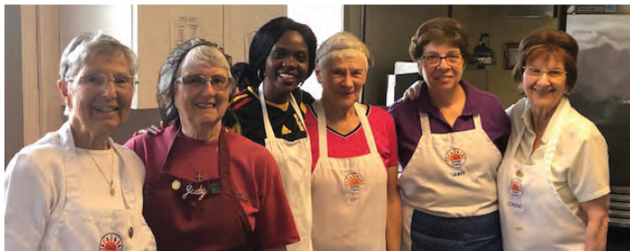
Kitchen Volunteers, thank you!