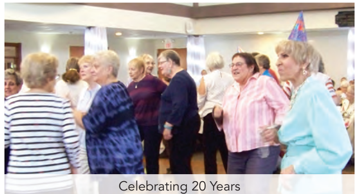
Celebrating 20 Years

We meet on Mondays from 10:00-11:30 am. Stop in sometime and hear what its all about!