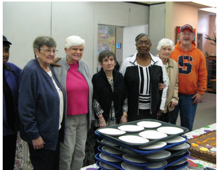
A reason to celebrate!

This program is funded by participants' donations, U.S. Administration on Aging, N.Y. State Office for the Aging, N.Y. State Department of Health, and Monroe County Dept. of HS/Office for the Aging.