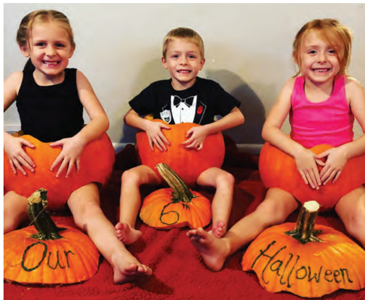
2018 Pumpkin Carving Contest Winners