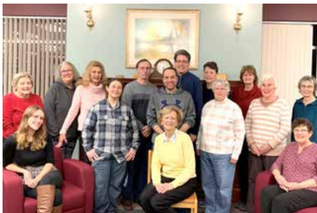
Friends of the Chili Public Library Board

The Chili Public Library is the center of lifelong learning for our community, and a welcoming responsive place people come to for the discovery of new ideas, the joy of reading and the power of information.